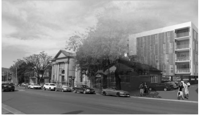
Artist's impression of the end result